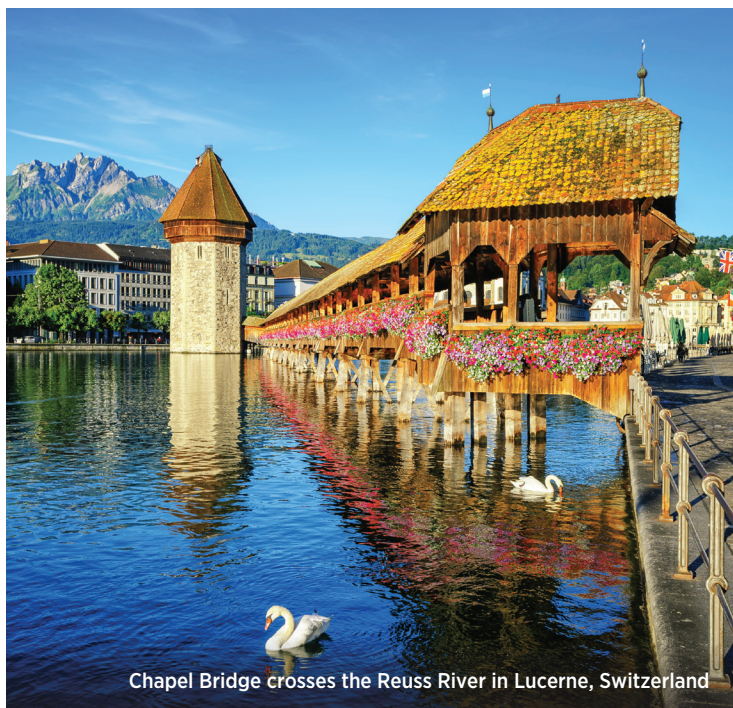
Chapel Bridge crosses the Reuss River in Lucerne, Switzerland