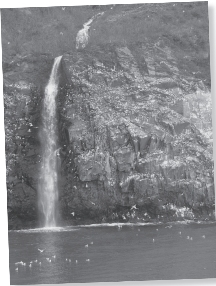
A rookery with a beautiful waterfall tumbling into the sea.