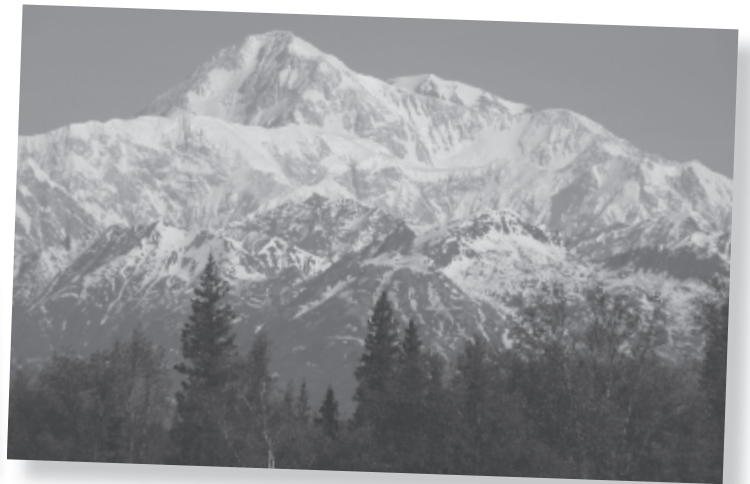
My name is the happy trans kenneis . Every day looks over the landscape. Its high peaks were visible all the days we were in sight of it, which is very unusual.