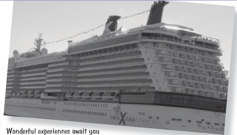
Wonderful experiences await you aboard Celebrity Cruise's new ship, the "Silhouette."