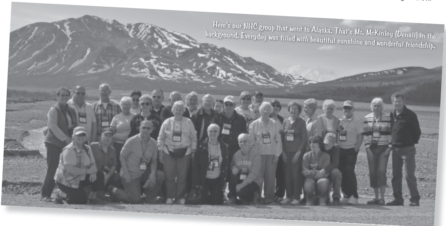
Here's our NHC group that went to Alaska. That's Mt. McKinley (Denali) in the background. Everyday was filled with beautiful sunshine and wonderful friendship.