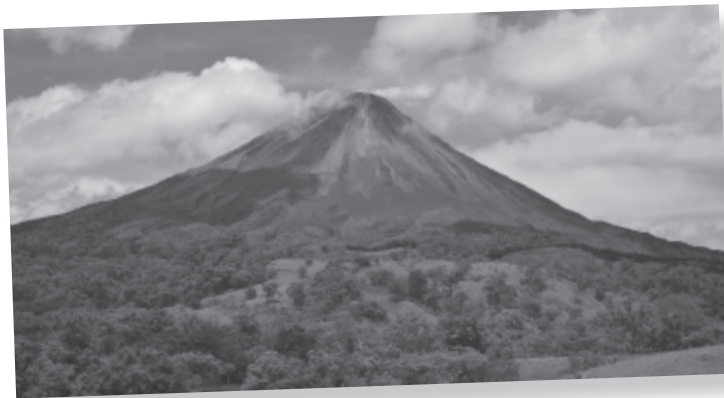
Arenal volcano looms over the landscape in the world. You may witness red lava streaming down the sides!